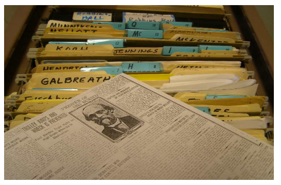
Files organized by family surname. Shown is a copy of Issac Ball's obituary in 1914.

work in progress. When downstairs space in the Center permits, it will be more accessible for persons who want to learn more about Tualatin families.